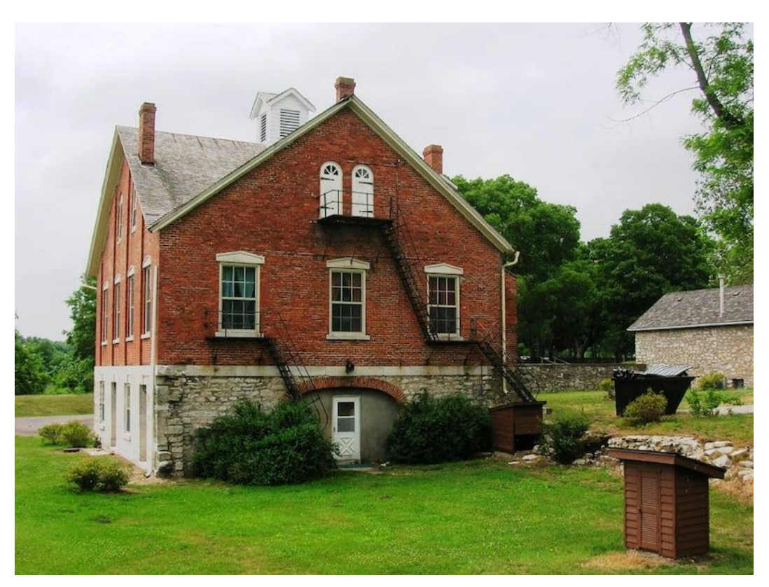
The Nauvoo House in Nauvoo, Illinois. The house was transferred by the Community of Christ to The Church of Jesus Christ of Latter-day Saints on Tuesday, March 5, 2024.

All the historic buildings involved closed on Tuesday to facilitate the transfer of ownership, but The Church of Jesus Christ of Latter-day Saints said all of the buildings are scheduled to reopen to the public on March 25.