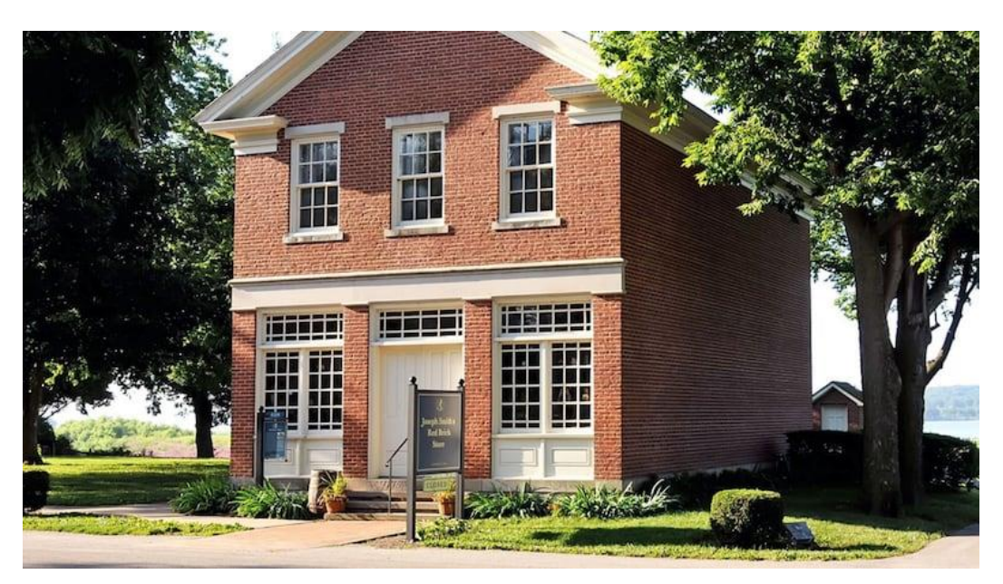
The Red Brick Store where the Relief Society was organized in Nauvoo, Illinois, in 1842. The store was transferred by the Community of Christ to The Church of Jesus Christ of Latter-day Saints on Tuesday, March 5, 2024.