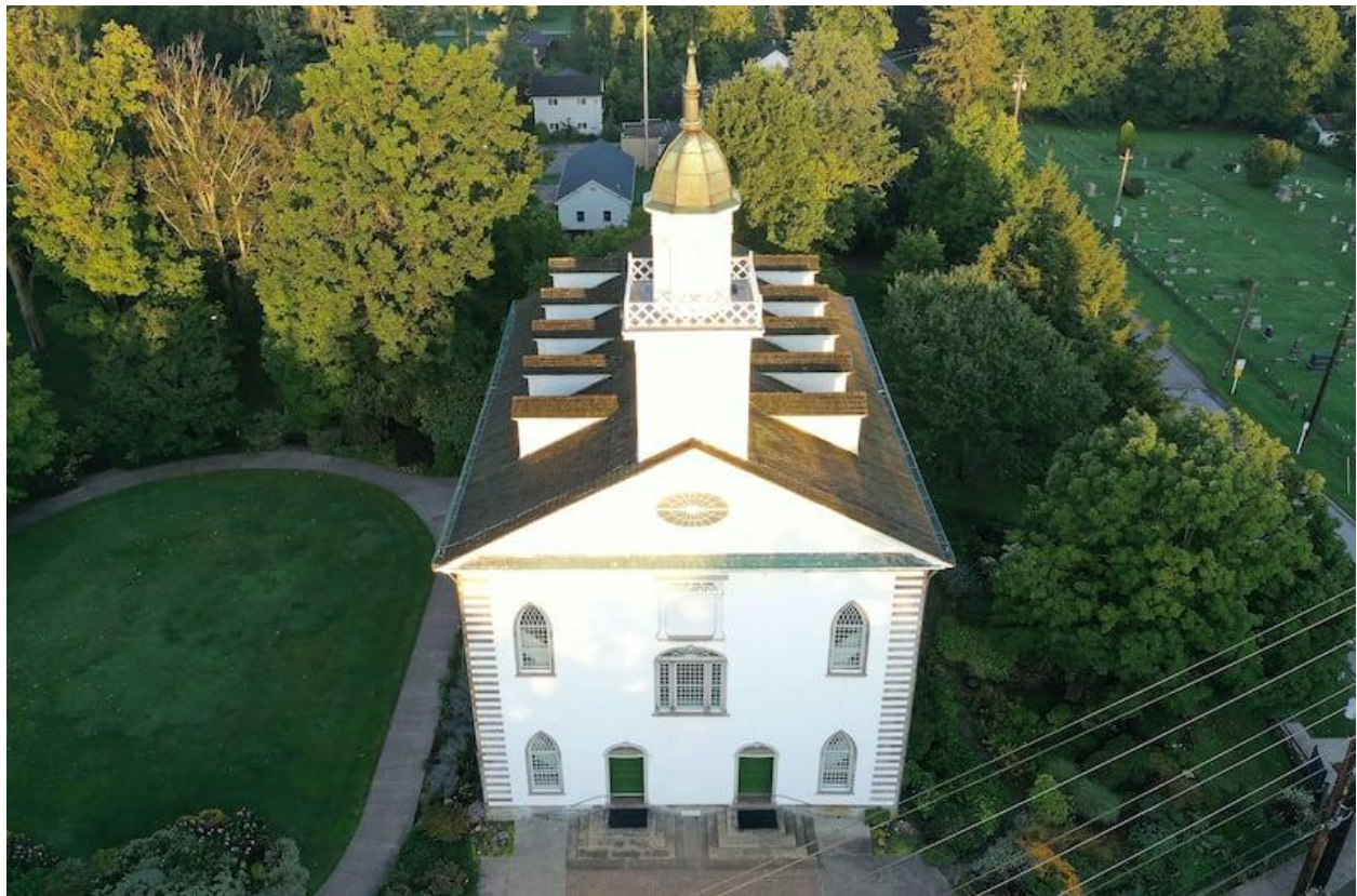
The sun rises on the Kirtland Ohio Temple in Kirtland, Ohio on Saturday, Aug. 26, 2023.

The Church of Jesus Christ of Latter-day Saints jointly announced the sale with the Community of Christ, formerly known as the Reorganized Church of Jesus Christ of Latter Day Saints