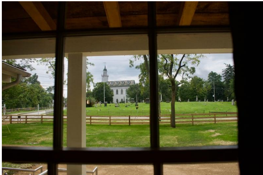
The Kirtland Ohio Temple is seen through a window of the Joseph and Emma Smith home in August 2023.

Elder David A. Bednar of the Quorum of the Twelve Apostles dedicated the restored home on Aug. 26, 2023. The home near has views of the nearby Kirtland Temple.