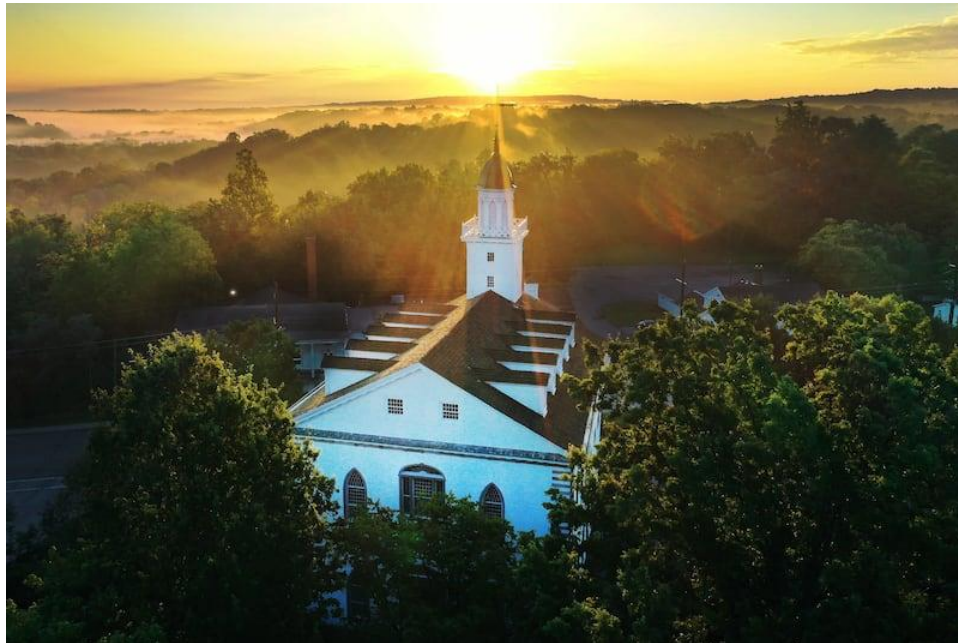
The sun rises on the Kirtland Ohio Temple in Kirtland, Ohio on Saturday, Aug. 26, 2023.

The Kirtland Temple is the centerpiece. It was nominated as a National Historic Landmark in 1969 and designated one in 1976.