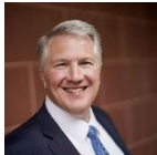
Tad Walch covers religion with a focus on The Church of Jesus Christ of Latter-day Saints.

© Deseret News, March 5, 2024. Retrieved March 8, 2024.