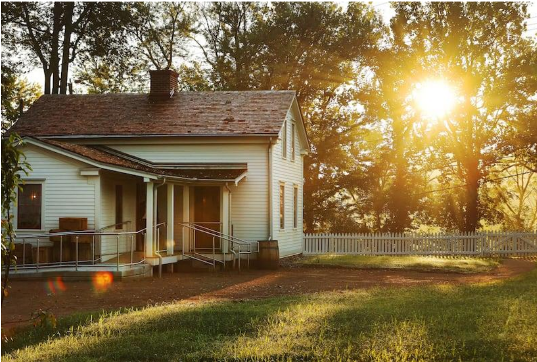
The sun rises on the Joseph and Emma Smith home in Kirtland, Ohio on Saturday, Aug. 26, 2023.

fill the world. That's true. I've been able to travel the world and see the fulfillment of that prophecy. So, coming to this place on this day is a sacred experience for me."