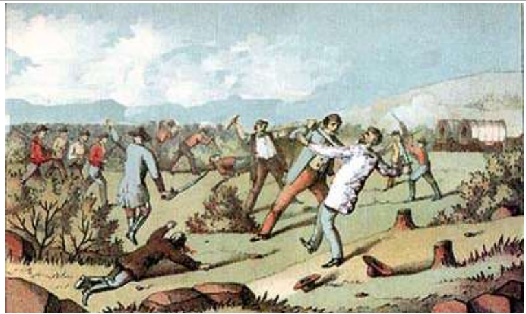
"Charge of the Danites" in the Missouri Mormon War