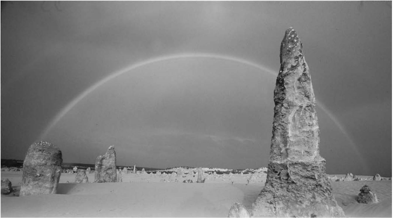
The rainbow — a reminder that there will not be another global Flood.

many commentators, writing well before plate tectonics was in vogue, believed that the division of Peleg referred to the linguistic/territorial division resulting from Babel. 34