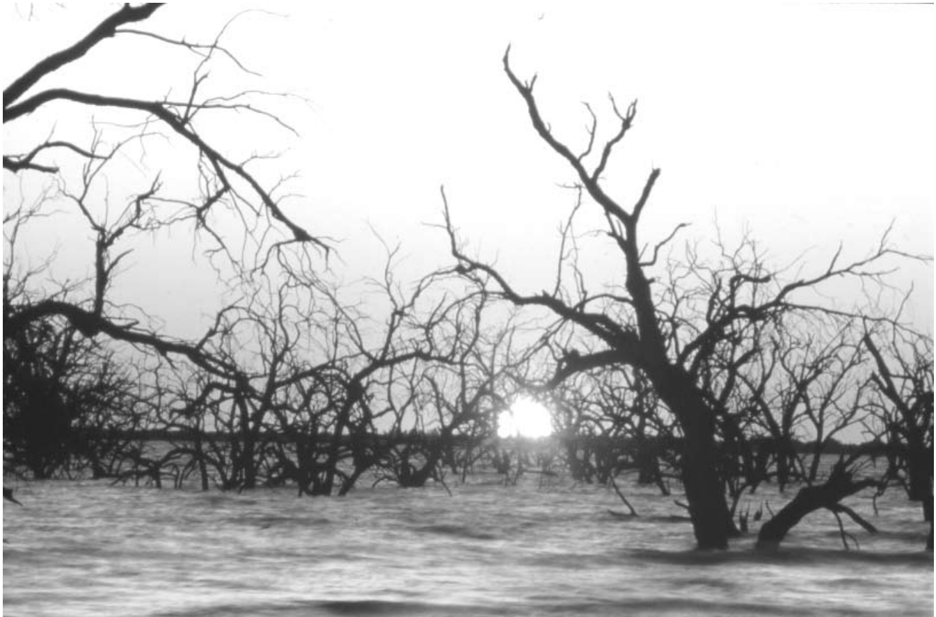
Water was the main agent of destruction for the Flood

ground cavities rather than relatively small terrestrial springs. Although the latter may explain the removal of all land creatures quickly, it is not consistent with the straightforward understanding of Gen. 7:17–24, which speaks of the waters prevailing (7:18), and then prevailing exceedingly (7:19) for 150 days (7:24). However, this prevailing is entirely consistent with subterranean fountains issuing water to the oceans with, no doubt, tsunami of continental proportions criss-crossing the globe and leading to gigantic tidal waves on reaching the shorelines of any exposed land.