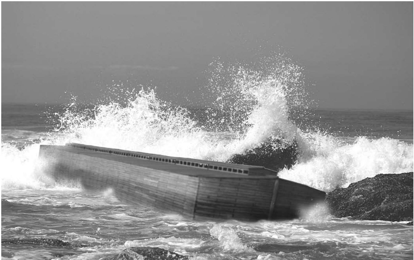
Whatever post-Flood disasters may have taken place, one must never marginalise the Flood itself.

of Gen. 8:22 would hardly follow, if the promise in v. 21 applied only to the inhabitants of the early Middle East, for ‘seedtime and harvest’ are universal phenomena, in the same way that ‘day and night’ bring us to the universal context of creation (Gen. 1:5). This apparent universality continues in Gen. 9, where it is not regional man whose life is protected by law, but man made in God’s image (v. 6). Accordingly, the covenant of Gen. 9:9ff. establishes the universally experienced rainbow as the pledge of God’s promise never again to destroy the whole earth (the word again is erets ).