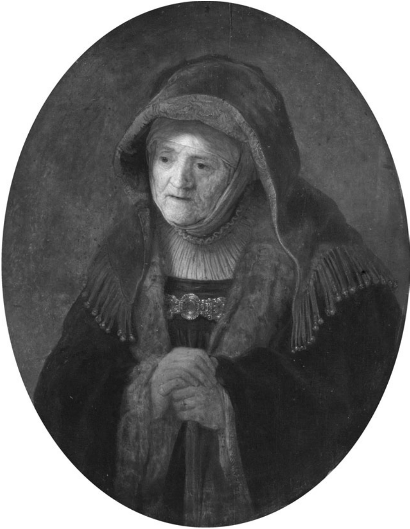
Figure 3. Rembrandt Harmensz van Rijn, Saint Anna (1639), Kunsthistorisches Museum, Vienna

or marble dimensions of the mystery of Incarnation – the import of gravity, the consequences of materiality for luminosity, ‘apotheosis’, a particular subject of Reformation Catholic art, and flight.