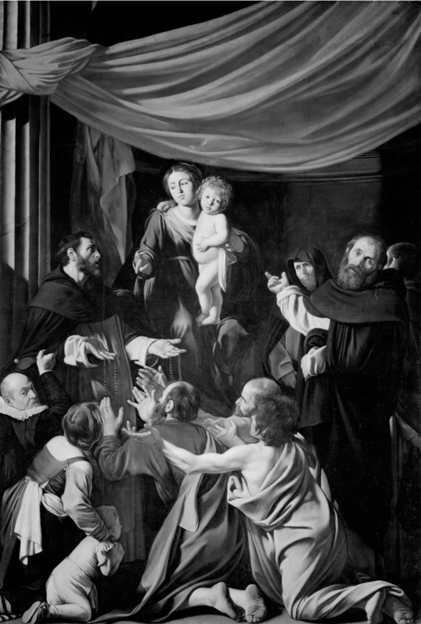
Figure 5. Michelangelo Merisi da Caravaggio, 'Madonna of the Rosary' (1606/7), Kunsthistorisches Museum, Vienna