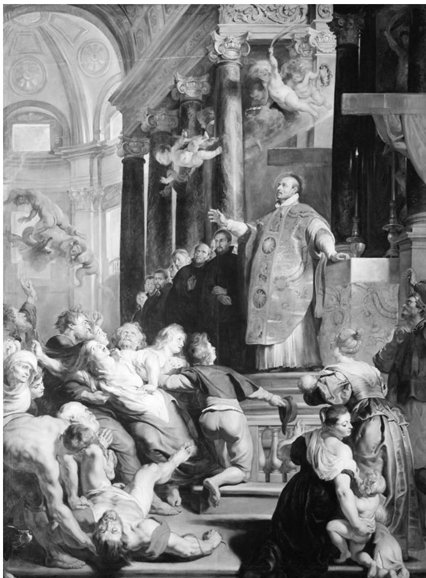
Figure 8. Peter Paul Rubens, 'The Miracles of Saint Ignatius of Loyola' (1615/16), Kunsthistorisches Museum, Vienna