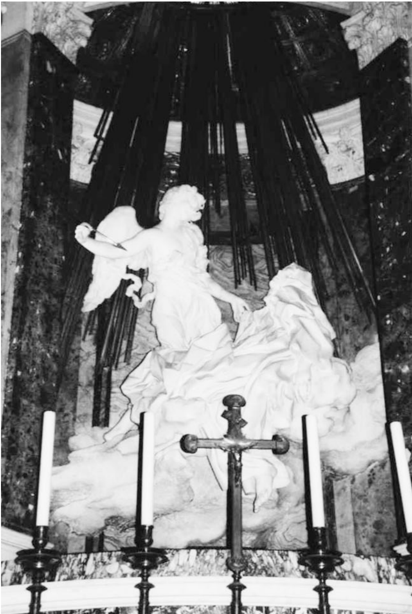
Figure 7. Gian Lorenzo Bernini, 'The Ecstasy of Saint Teresa', Cornaro Chapel, Rome