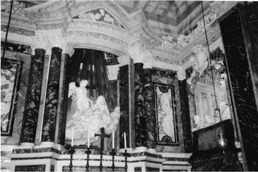
Figure 6. Gian Lorenzo Bernini, 'The Ecstasy of Saint Teresa', Cornaro Chapel, Rome

alludes to the connection mystics had made between ecstasy and death. 29 The placement of her transverberation over the altar links in marble and gold sacramental liturgy and saints and their cults.