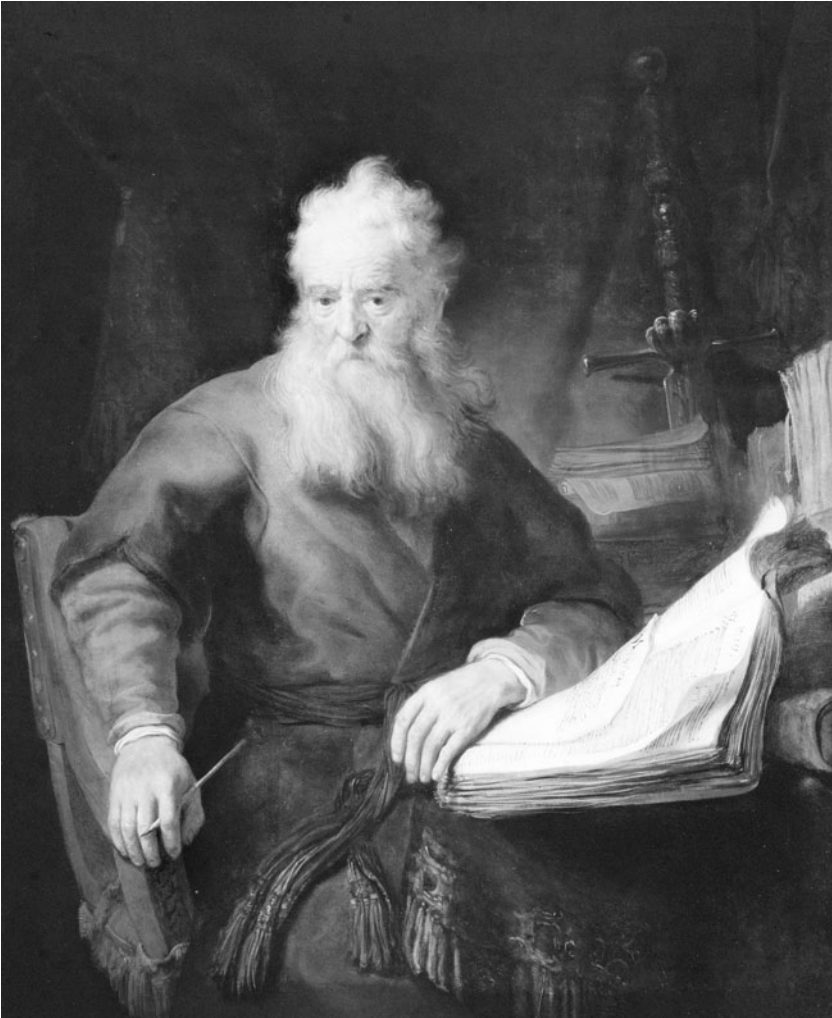
Figure 4. Rembrandt Harmensz van Rijn, Saint Paul (1633?), Kunsthistorisches Museum, Vienna

for their own churches in the seventeenth and eighteenth centuries. But the great artists of the Counter-Reformation were also integral to the articulation of the Baroque style: Carracci, Bernini, Rubens, Tintoretto, Caravaggio. The Baroque style of art, like its counterpart in theatre, is more expressive of a nuanced range of emotions and spiritual states than were its medieval