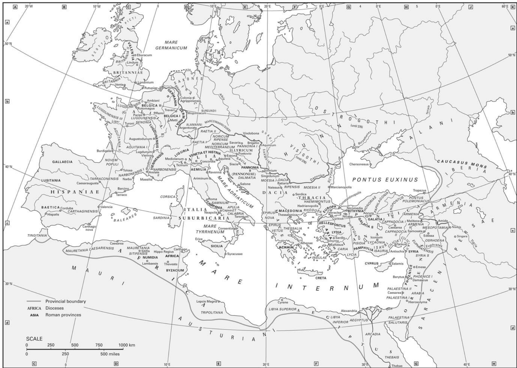
Map 1 The Roman empire, c. 400