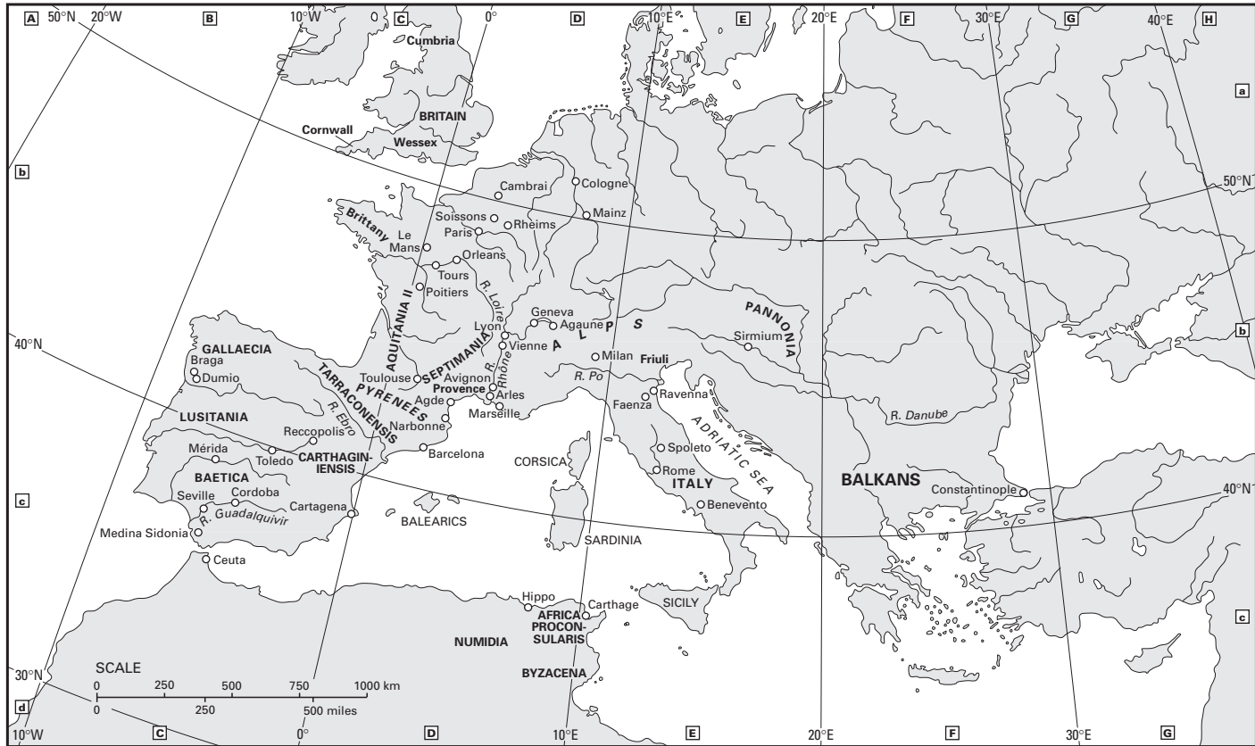
Map 2 Rome and the West, c. 600