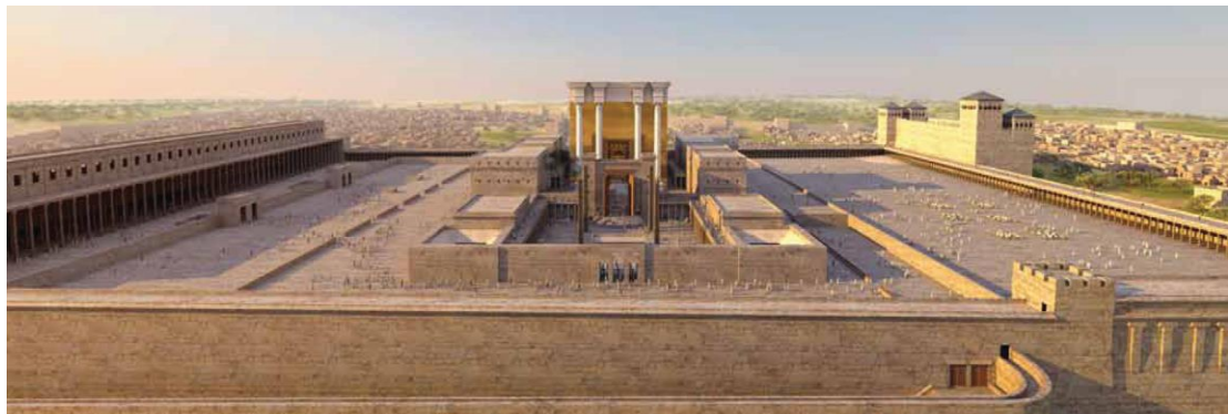
© Rose Guide to the Temple