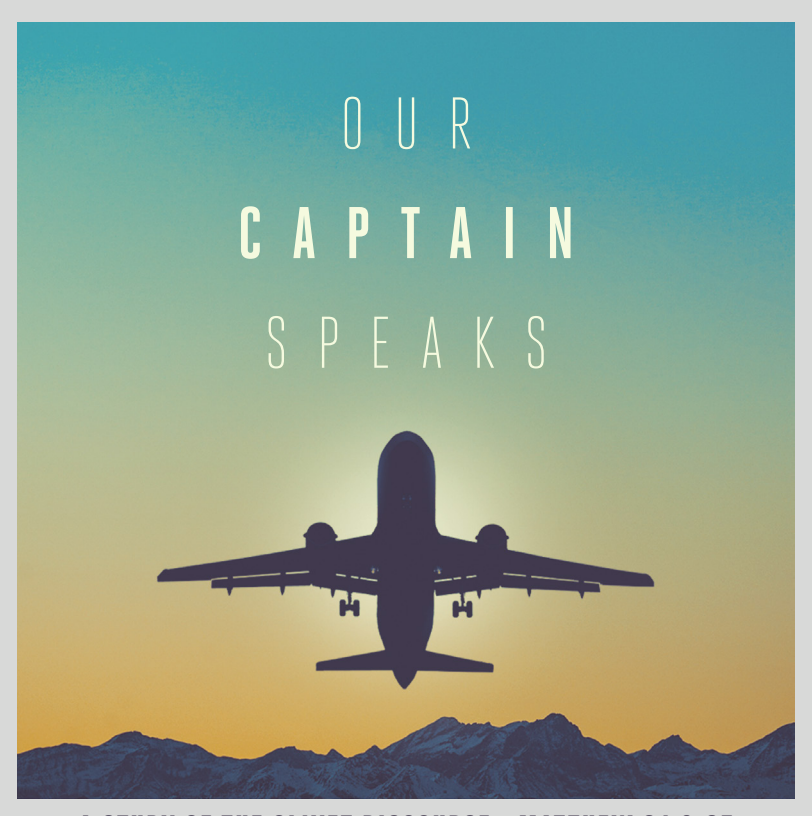
A STUDY OF THE OLIVET DISCOURSE · MATTHEW 24 & 25