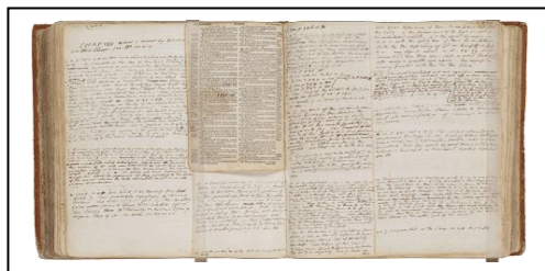
(Jonathan Edward's Bible)

The literal interpretation of a biblical text is not always the best interpretation.